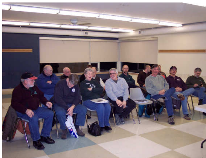
February club meeting