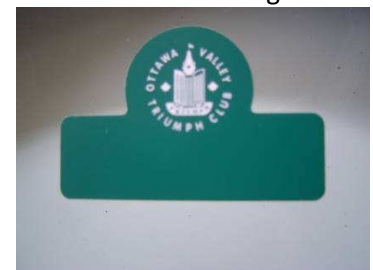
OVTC name badges

If you don't have one yet let me know and I will get your name engraved on one