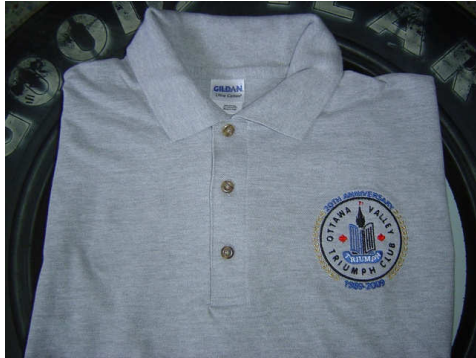
20 th Anniversary Golf Shirts $25