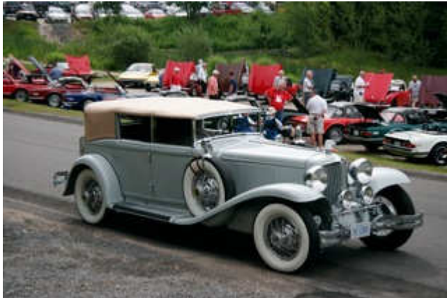
The hood ornament is a crystal eagle's head.

But the most interesting car was not even in the show. The mayor of Huntsville graced us with his presence arriving in his mint condition 1930 Cord. Think of it as an American Rolls Royce.