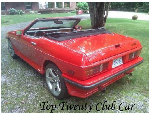
Top Twenty Club Car