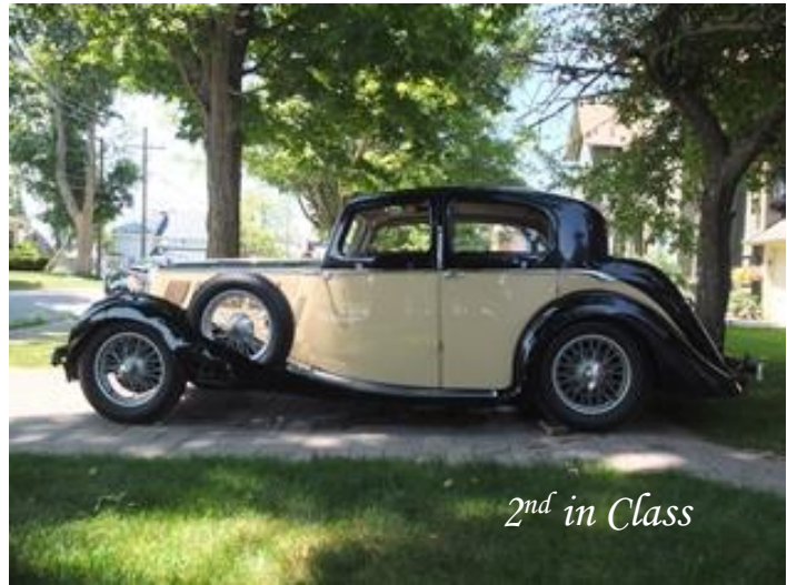
2 nd in Class