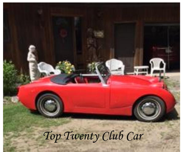
Top Twenty Club Car