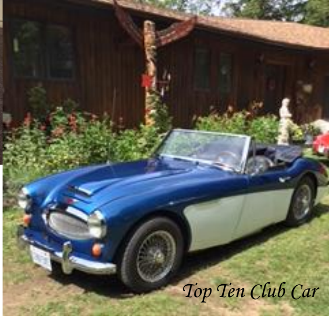
Top Ten Club Car