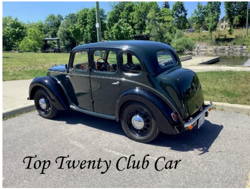
Top Twenty Club Car