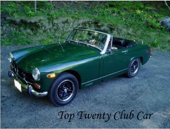
Top Twenty Club Car