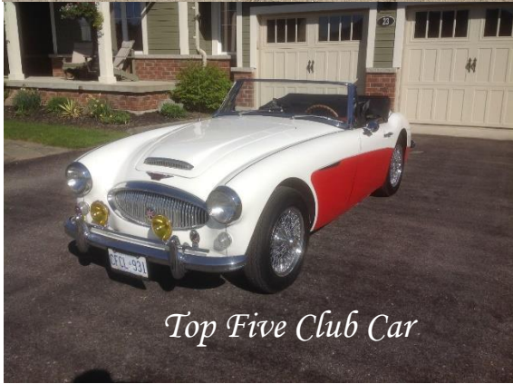
Top Five Club Car