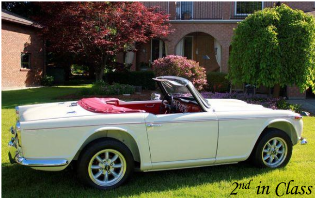
2 nd in Class