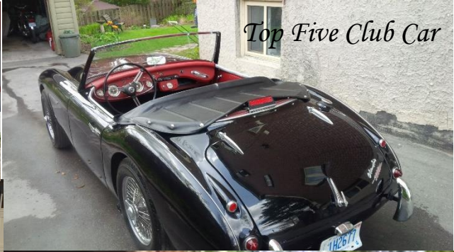
Top Five Club Car