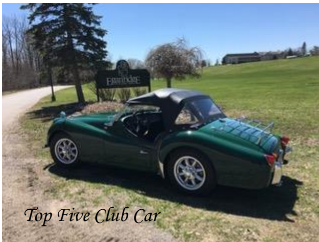
Top Five Club Car