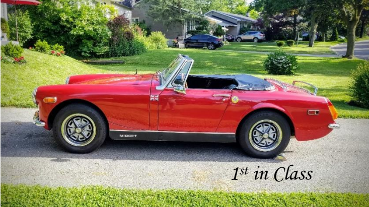
1st in Class