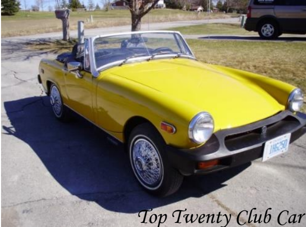
Top Twenty Club Car