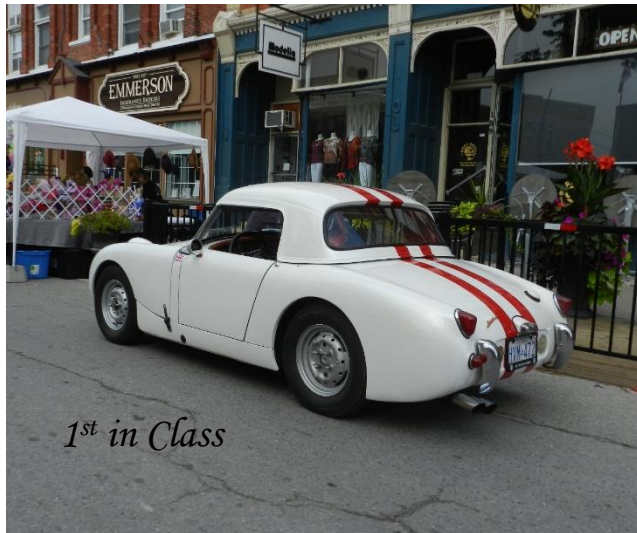
1 st in Class