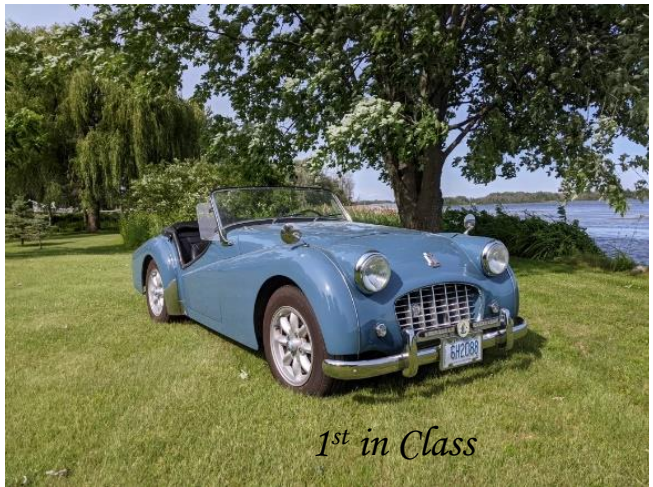
1 st in Class