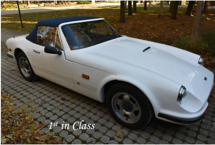
1st in Class