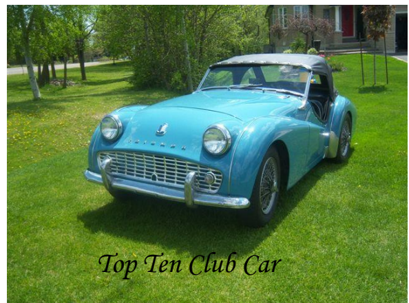
Top Ten Club Car