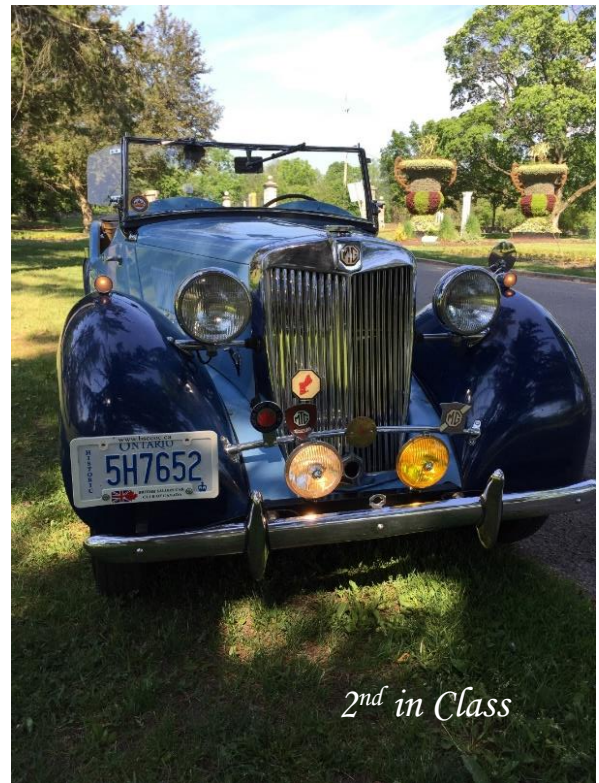
2nd in Class