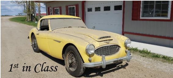
1st in Class