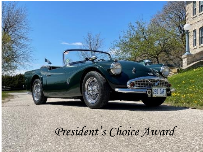
President's Choice Award