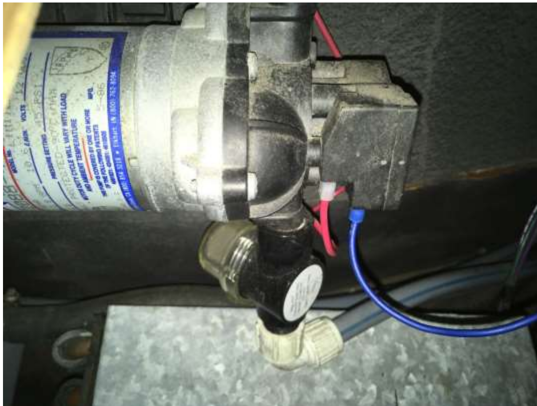
Hot-wiring an electric motor directly to the battery

I searched online for the fresh water pump and learned that it's a hundred-dollar part. I immediately launched into test-the-device-directly mode. I took a length of 12-gauge wire, crimped a ring terminal on one end and a spade terminal on the other, attached the ring terminal to the battery positive terminal, pulled the wire off the pump's positive terminal, and slid the spade terminal of my test wire onto it. (Note that this can be done without crimping connectors onto the ends, but it's safer doing it this way. You really don't want an unfused wire, connected directly to battery positive, slipping and dead-shorting itself to ground).