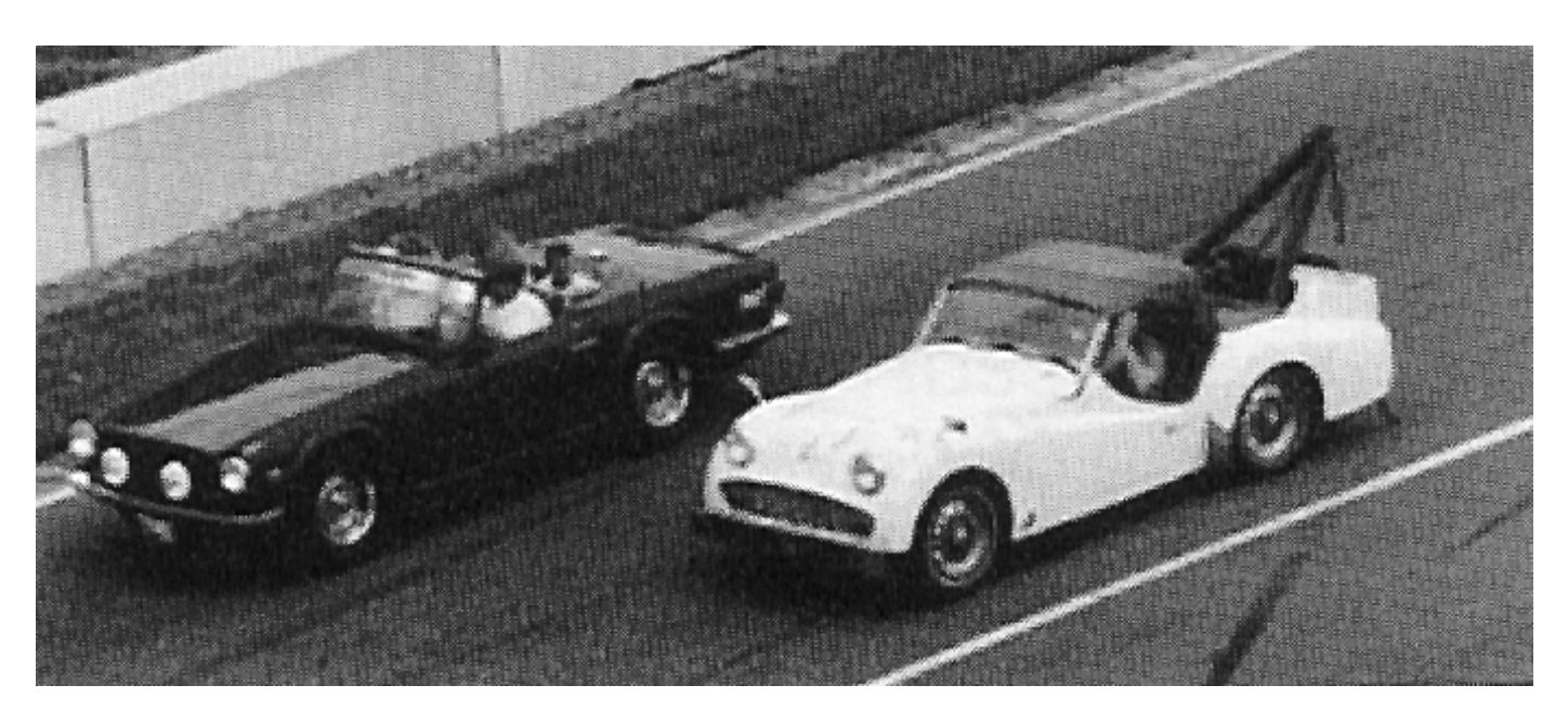
"Hey buddy – did you see an MGB at the side of the road somewhere along here?"