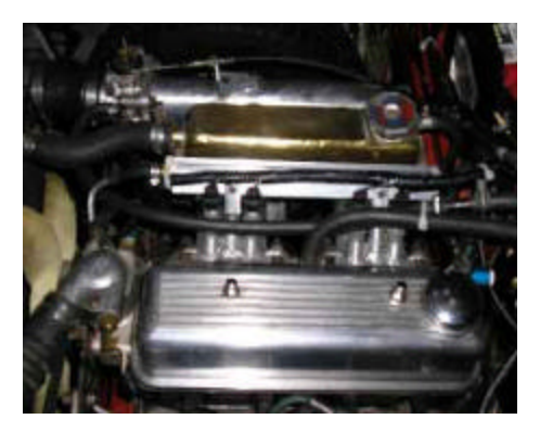
Air is gathered through a K&M filter located in front of the radiator through a cold air box. Note the air temp sensor is below the intake neck.