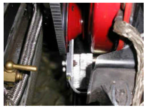
the top for the return line.

The SDS controller is programmed and adjusted by a hand held controller and a fuel mixture knob, both of which can be disconnected when the settings are attained. An Autometer digital fuel mixture gauge monitors the fuel mixture based on a signal obtained from a heated O2 sensor which I installed in the exhaust pipe just behind the header.