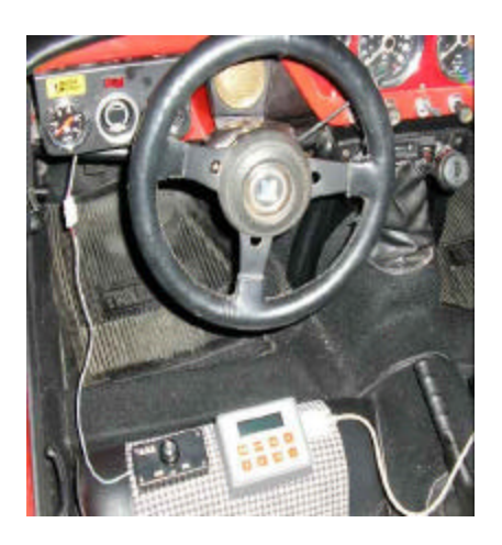
EFI update for Joe Curry's 63 Spitfire 4 (FC4505L)

These photos show the simple installation of a Simple Digital Systems [SDS] Electronic Fuel injection system in an early Spitfire 4.