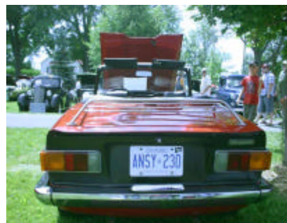
A nice little TR6 ..all decked out...