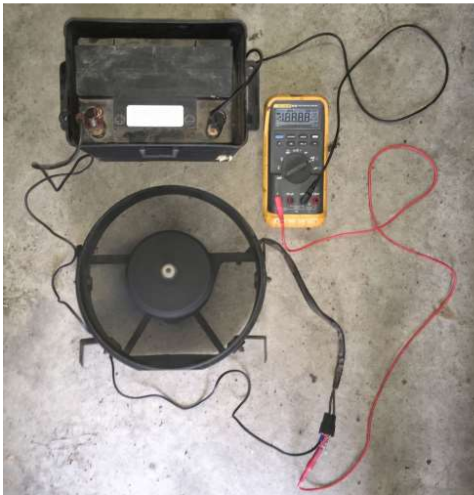
Meter in series in a real circuit, measuring current

The photo below shows the meter measuring current on a small fan in a circuit that we've removed from a car for clarity. The positive battery terminal is connected to the positive terminal of the fan. The fan's negative terminal is connected to the meter's red lead, and the meter's black lead is connected to the negative battery terminal. You can't read the meter's display, but it is showing about 5 amps.