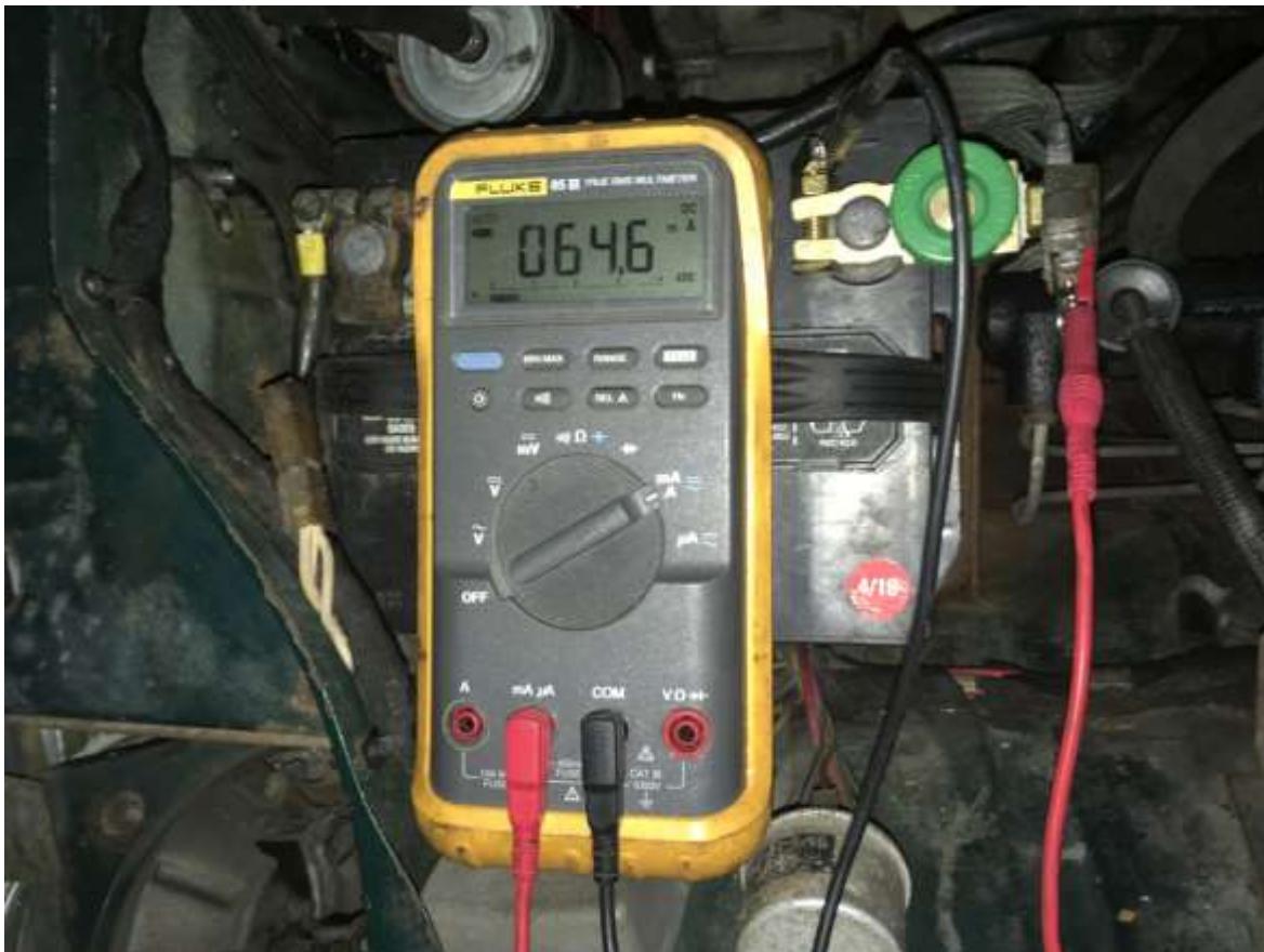
A battery with a battery disconnect switch (green knob) installed, and the meter connected across the disconnect switch, between the battery negative terminal and ground

In the figure below, the above steps have been taken, and the multimeter is reading 64.6 mA (milliamps) on its sensitive setting, which is a minor parasitic draw that I've simulated by leaving the car's dome light on. On a modern car with control modules, 70mA is usually considered an acceptable parasitic drain, but less than 30mA is even better.