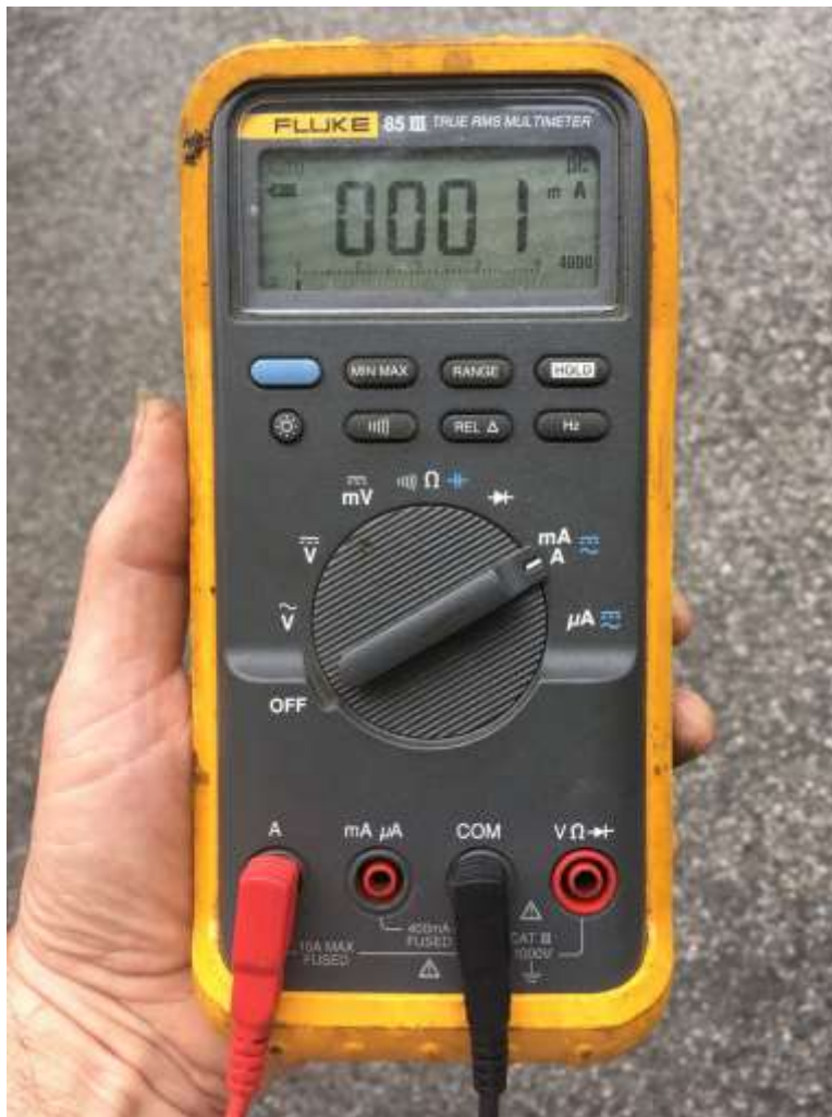
A multimeter configured to measure current on the high amperage setting (red probe in the “A” socket, rotary dial turned to the A setting)