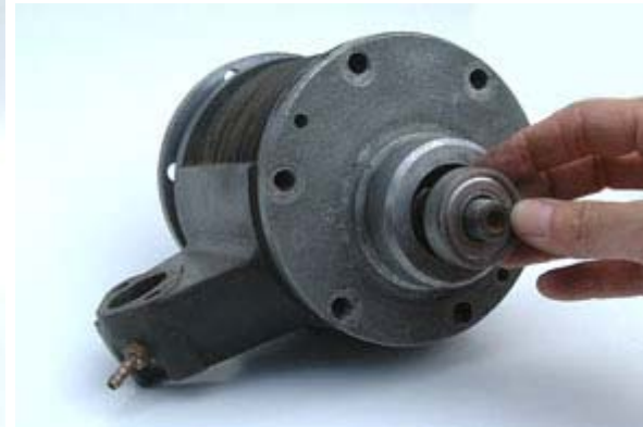
2. Use two 5/16th USS bolts to remove rear cover The main bearing fits snugly into the front housing