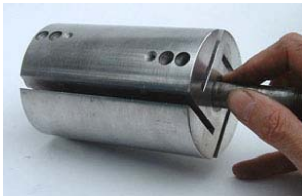
The rotor has been dynamically balanced for smooth running